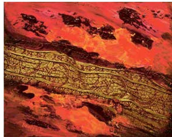
Saree Series Peach by Brinda Pamulapati, 8 x 10 inches Mixed Media-Saree and acrylic on clay board

Vorticism was a short movement that lasted only for a few years, from 1914 to 1920, when World War I began and brought the movement to an end. Additionally, the undertaking was emerging in Britain during the same time as Futurism was gaining popularity in Italy. Both movements found inspiration in the simple shapes of the industrialized cityscape and depicted the dynamism, energy and movement of modern life.