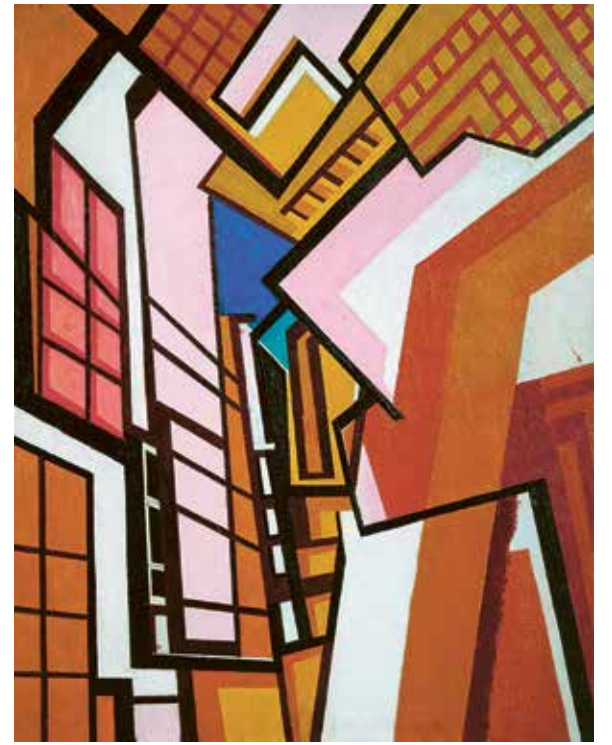
Wyndham Lewis, Workshop c. 1914-15

the modern and everchanging world. To me, Vorticism represents the energy of the artist after absorbing all the immediate visual scenes that we are presented with. This intake results in a passionate and creative blast of ideas filled with