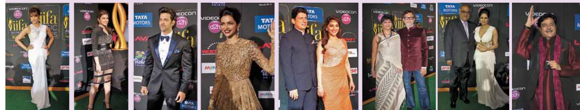
Bottom row of the green carpet arrivals photos by Sonia Kallarakal