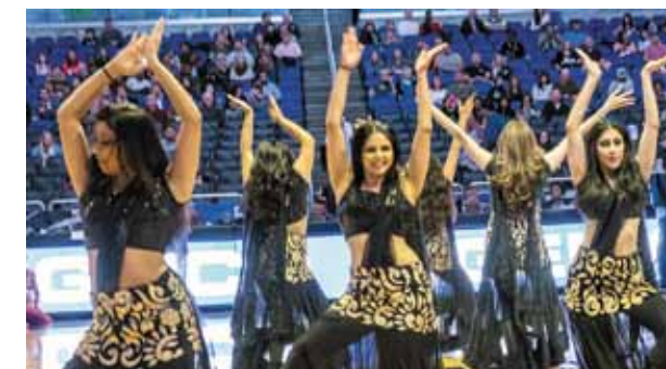
Half time performance