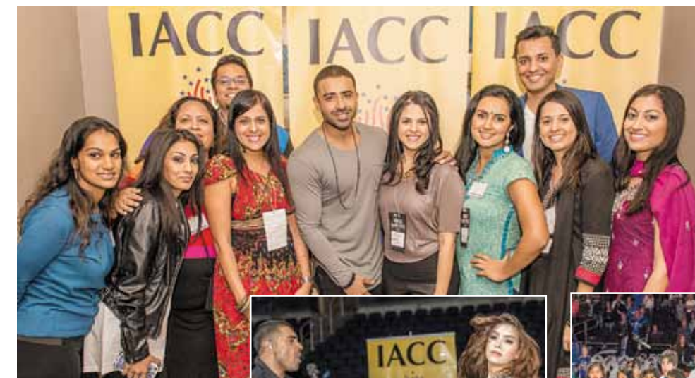
Leadership Committee with Jay Sean.