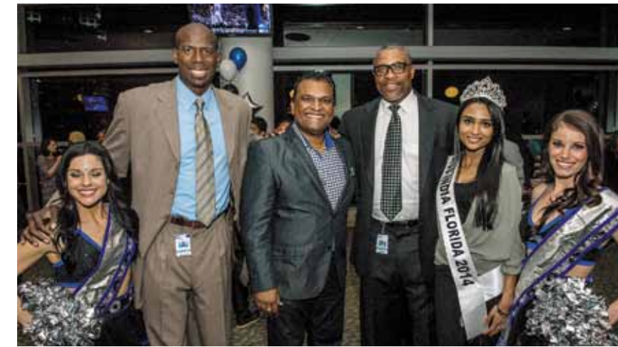
Magic players and magic dancers with property appraiser.

The Street Fest was, as usual, an immensely popular event. The Indian and Bollywood dances,