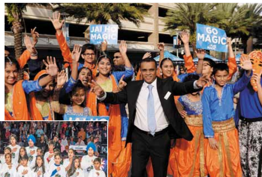
Kids singing the national anthem.